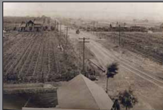
Pines Rd looking south to Broadway, 1908