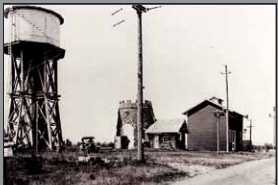
Vera Water & Power, 1908