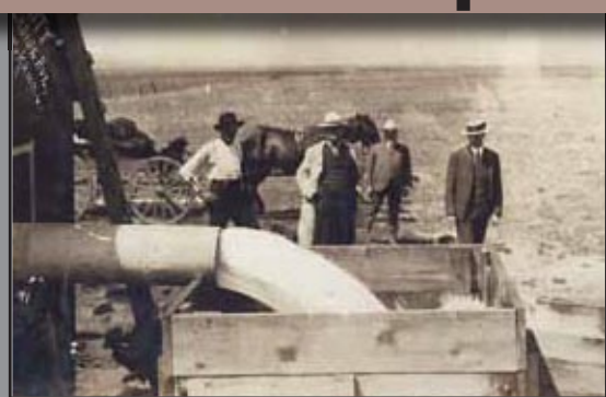
Modern Electric & Water, 3,000 GPM, 1908