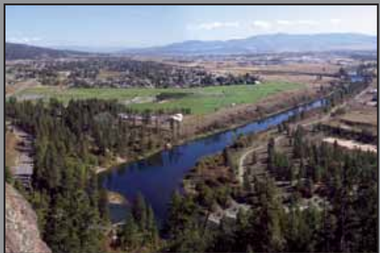
2004 photo with same view as watercolor