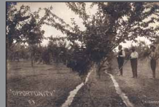
Apple orchard in Opportunity, WA 1908