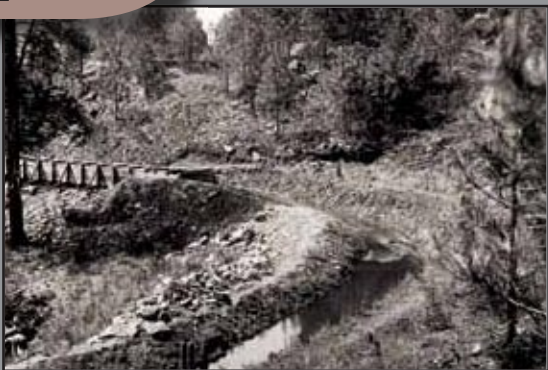
Irrigation System, Post Falls, ID 1900