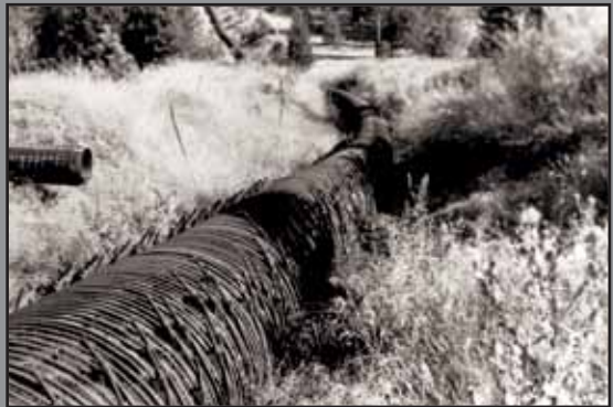
Wood stave pipe, Rathdrum Prairie, ID 1961