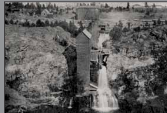
Post Falls Lumber Co sawmill pre-1902