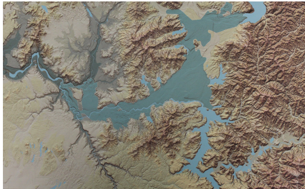
Spokane Valley - Rathdrum Prairie Aquifer