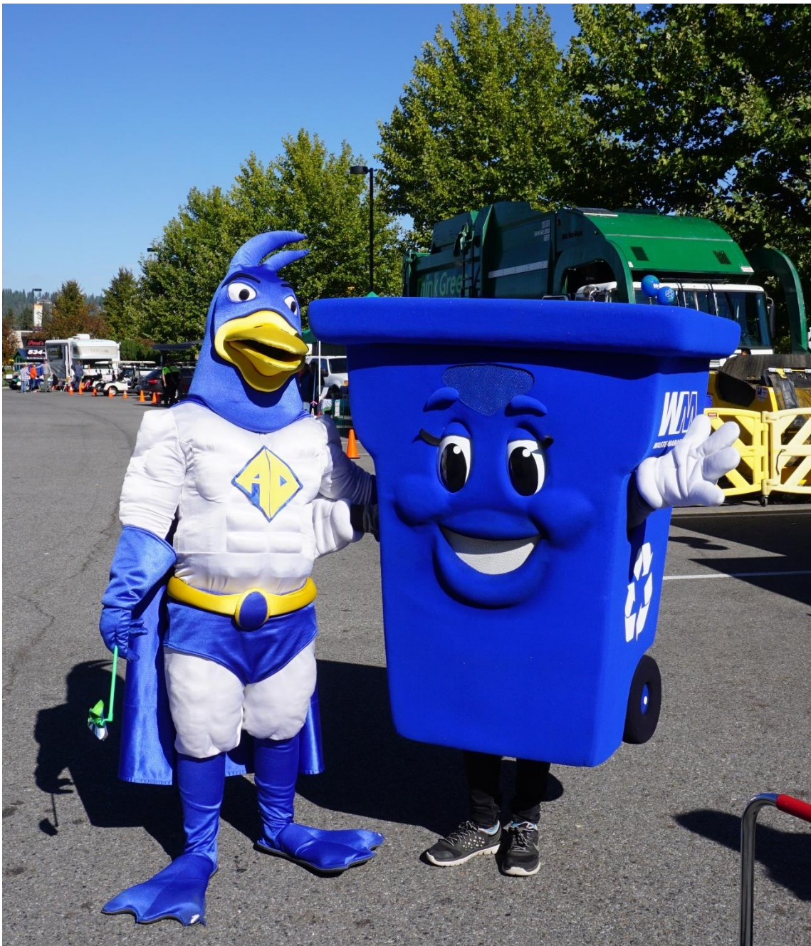
Aqua Duck Meets Big Blue