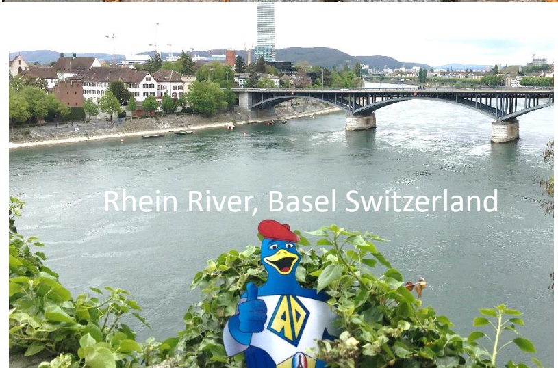
Rhein River, Basel Switzerland