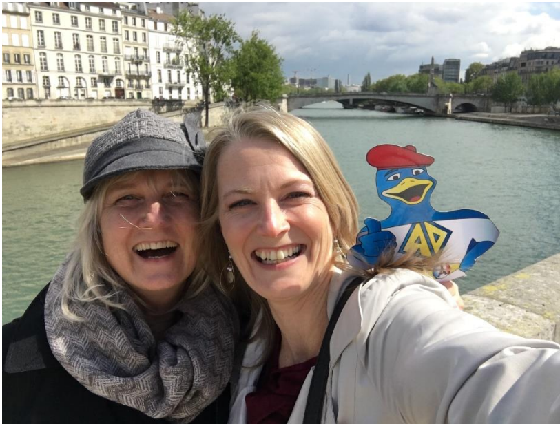
Seine River, Paris France

Fire Hydrants are imbedded in the streets at Aachen, Germany