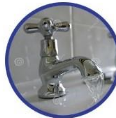
Find My Water Provider