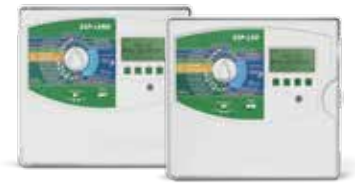
Rain Bird® ESP-LXMEF or ESP-LXD with IQ 3.0