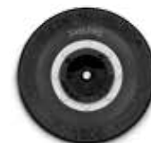
Rain Bird® 1800-SAM Series