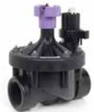
PESB-R Series Valves