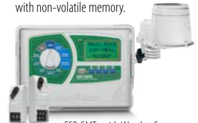
ESP-SMTe with Weather Sensor

Rain Bird offers a full line of smart controllers, all with non-volatile memory.