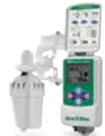
WR2 Wireless Rain/Freeze Sensor