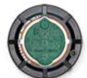
Rain Bird® 5000-Plus-SAM