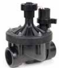
PEB / PESB Series Valves

► (ss) MASTER SHUT-OFF VALVE Rain Bird offers plastic, brass and combination plastic and brass valves that can be used as master valves.