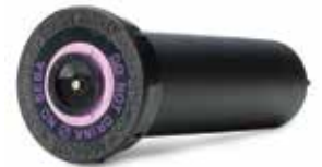
RD1800 Series Sprays

Rain Bird offers components designed specifically to withstand the harsh conditions found in recycled water, like the RD1800® Series Sprays and PESB-R Series valves.