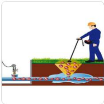
Outdoor Leak Detection

Outdoor Watering Nerds can connect you to Professionals and Do It Yourself resources for outdoor leak detection, sprinkler repair and retrofit, and landscape design. The Nerds are excited to bring you how-to videos, water saving tips, rebates, classes, and events in Kootenai and Spokane counties. Saving water outdoors protects your pocketbook, economic growth, the Spokane River, and our sole source of drinking water, the Spokane Valley Rathdrum Prairie Aquifer. Good for you. Good for our future.