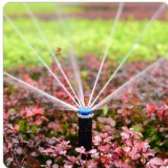
Sprinkler Repair & Retrofit