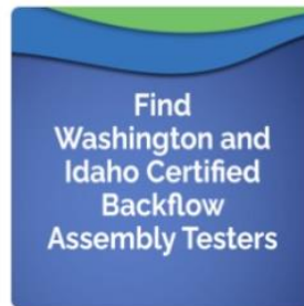
Find ID & WA Certified Backflow Assembly Testers