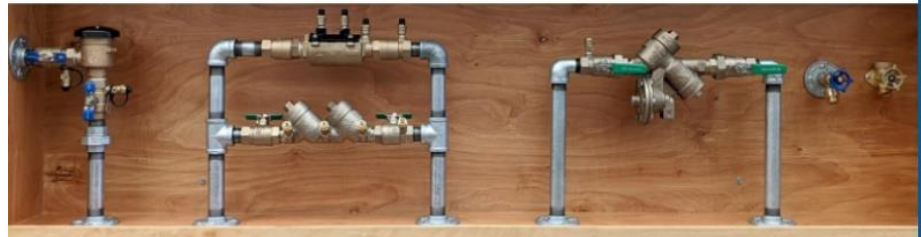
Sample Backflow Devices.