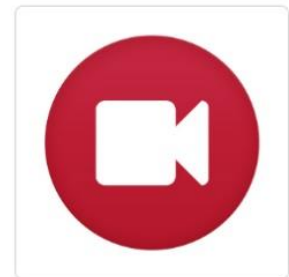
Backflow Protection Videos