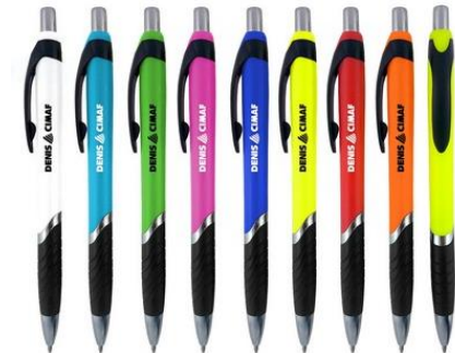
1,000 pens $380