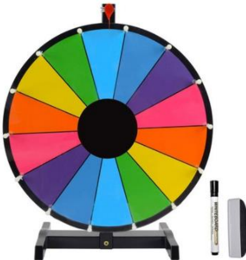
1 Game Spinner $199.48