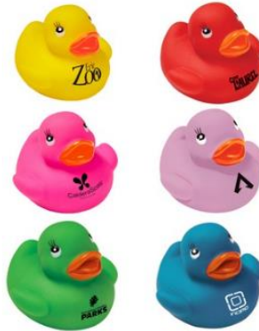
250 Ducks 2" $322.50