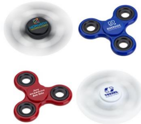
250 Whirl spinners $372