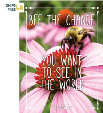
500 Seed Packets $225